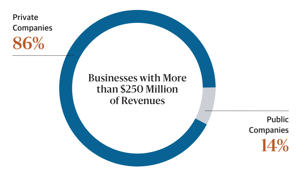
Exhibit 2: Breakdown by Revenues: Private Companies are a Critical Portion of the Global Economy<sup>8</sup>

Exhibit 1: Private Investment Opportunities Substantially Exceed Those in Public Markets<sup>7</sup>